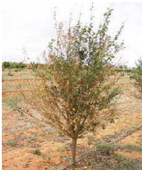
Figure 10. Pronounced dieback in Sunrise lime

At Merbein, fruit ripens in the experimental block in August to September and is harvested in September. In cultivation, fruit has generally been harvested in August.