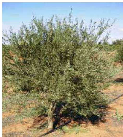
Figure 6. Outback lime tree