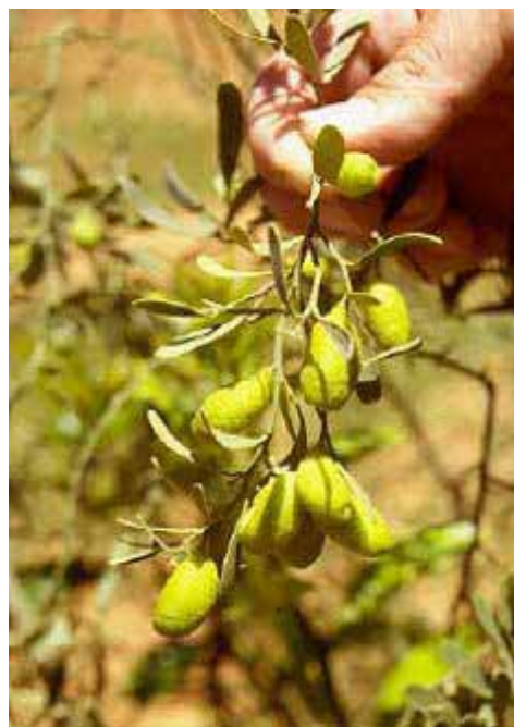
Figure 5. Outback lime fruit

Fruit is produced on an attractive, dense, upright shrub to small tree, usually 2 to 3 m high and 2 m wide with dark, glossy-green foliage and red growth flushes. The oval-shaped leaves are approximately 25 to 35 mm long by 15 mm wide, with slightly serrated edges. Short, stiff, slender