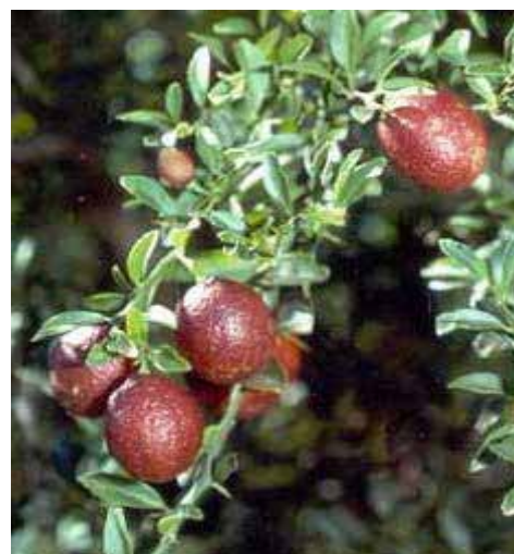
Figure 7. Blood lime fruit