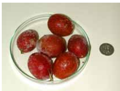
Figure 1. Blood lime