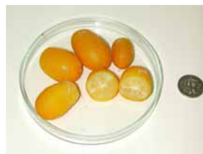
Figure 3. Sunrise lime

Australia has six species of true native citrus 1 . Previously they were classified as being in two genera ( Eremocitrus , desert limes and Microcitrus , finger limes). However, recent taxonomic work has led to their reclassification and they are now included in the genus Citrus (along with oranges, lemons, limes, etc), emphasising their close relationship with 'conventional' citrus 2 .