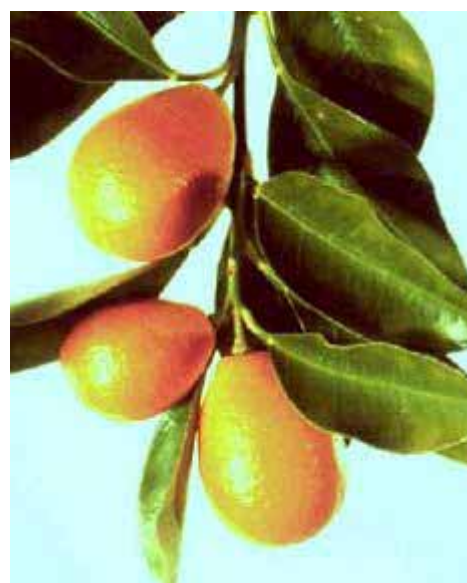
Figure 9. Sunrise lime fruit

During spring 2000 a twig and limb dieback was observed in Sunrise Lime in several districts. In general, the first symptom noted was the wilting of leaves and death of branches, up to 1cm in diameter, although this symptom was actually preceded by the (often unnoticed) death of smaller twigs and shoot tips. While most Sunrise Lime trees in each affected block showed symptoms, only some branches on each tree were affected, with adjacent branches apparently healthy and often showing growth flush. The causal agent for the disease has been identified as a Phoma sp.