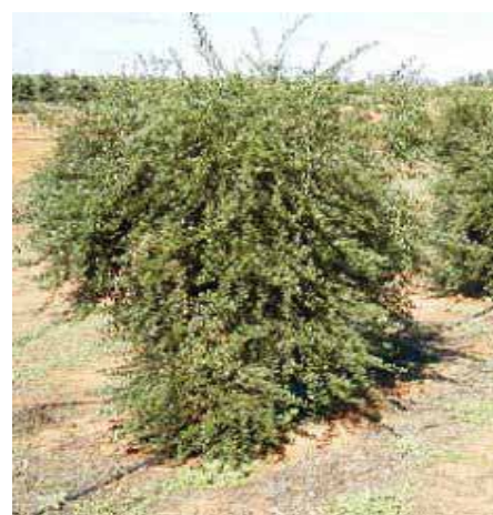
Figure 8. Blood lime tree

While it is early days for this cultivar, post harvest problems have been an issue. In the 2001 harvest, fruit quality problems were encountered due to Sour Rot, with thorn damage, tree habit, management and seasonal issues involved. Physiological breakdown of packed fruit also contributed to losses.