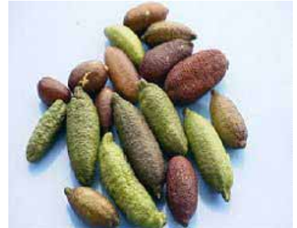
Figure 4. Australian Finger Limes

Citrus australasica (previously Microcitrus australasica ), commonly known as the Australian finger lime, occurs as an understorey shrub or tree in rainforests in southern Queensland and northern New South Wales. It produces finger-shaped fruit, up to 10cm long, with thin green or yellow skin and green-yellow compressed juice vesicles that tend to burst out when the skin is cut. A pink to red-fleshed form with red to purple or even black skin (known as Citrus australasica var. sanguinea ) also occurs in the wild.